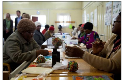
Active ageing: the seniors at the Monwabisi club

We expect it to cost in the region of R30 000 to achieve the above objectives.