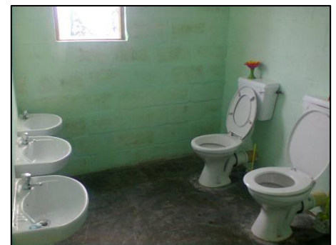
New ablution block

Today Lutho Educare is going from strength to strength thanks to good leadership, careful administration and its dedicated staff. Despite the fact that parents are poor and cannot afford high fees, Nothlangabezo continues to encourage them to pay fees and keep the school in operation.