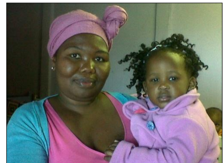
Safe and happy at school

Also on the property are two re-purposed shipping containers. These too serve as classrooms and while the space inside them is highly conducive to preschool activities – the five window frames in the structure are badly rusted. We would like to repair these as soon as funding is available.