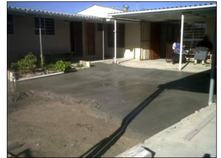
A brand new courtyard

Thank you for your support in returning Masakhane to full capacity.