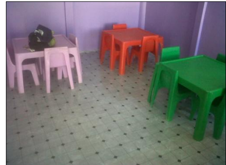
A clean and tidy classroom

This preschool situated in Khayelitsha not far from our Kwakhanya ECD Centre caters for the needs of 30 preschoolers who range in age from 2 to 6 years of age. A few months ago this preschool had a leaking roof and very little shade for the children to play in. Their ablutions were inadequate and toilets did not operate at full capacity.