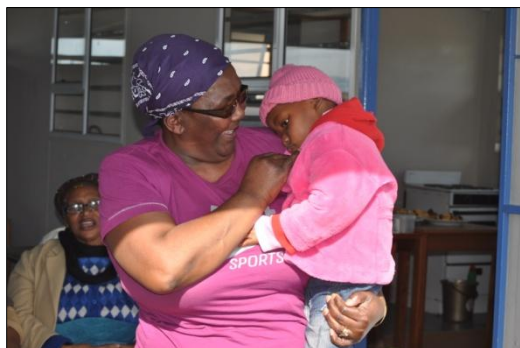
Seniors caring for grandchildren

We are grateful for your ongoing commitment to our work.